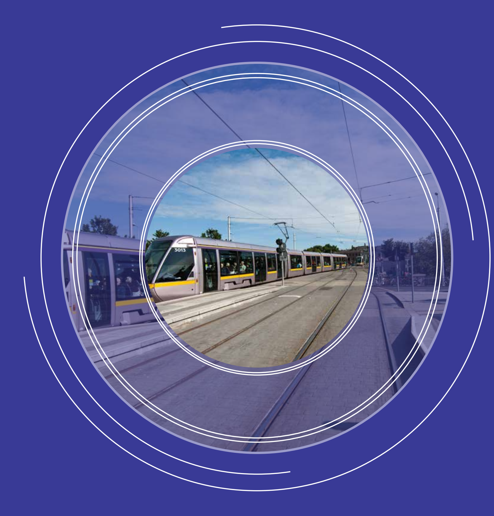
Our Vision: To set the standard for managing safe and sustainable mobility solutions